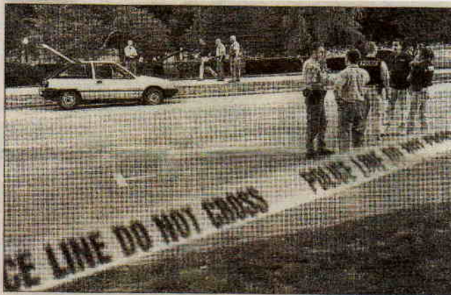
Residents say the shooting suspect was a common sight in the area. They say the man was apparently homeless and spent a lot of time around his vehicle.

Church Street, near the intersection of State Street, and saw two police cars pull onto Church. He said he heard shots a short time later and looked up to see officers firing.