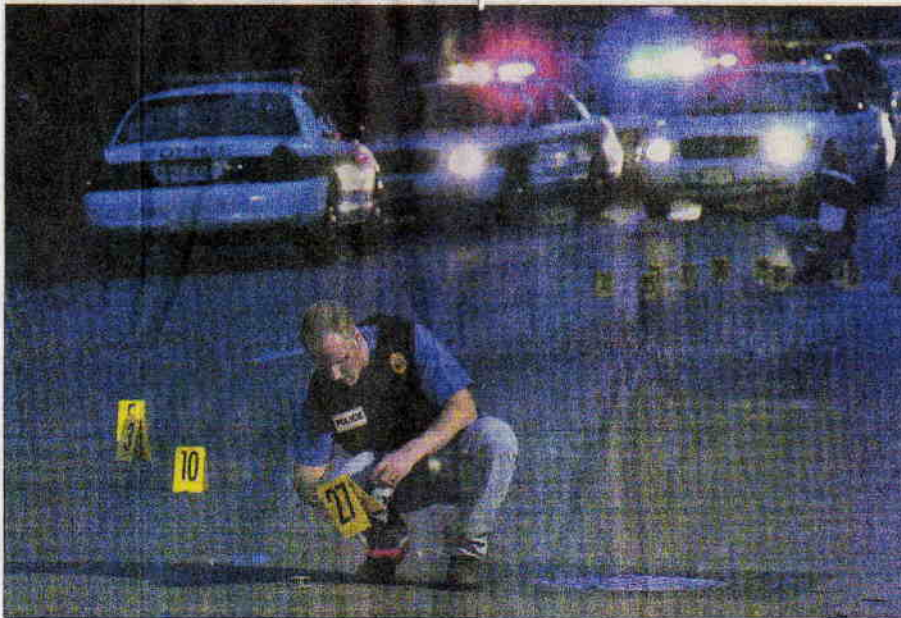
ABOVE: A police officer marks the positions of spent shell casings Thursday evening after Champaign police officers exchanged gunfire with a suspect at the edge of Champaign's West Side Park on Church Street. BELOW: Bullet holes riddle the front passenger side of the suspect's vehicle.

He declined to comment on the circumstances of the shooting.